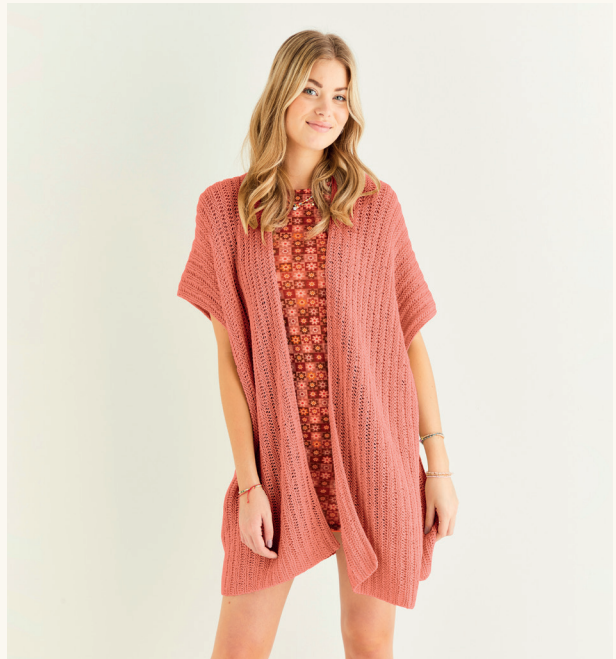
830 After Glow