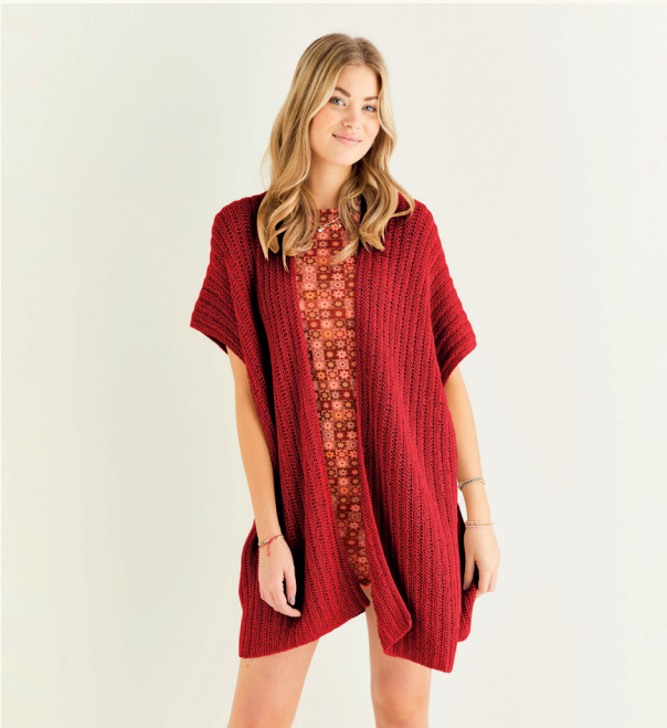
808 Date Night