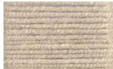
833 Sandy Toes

Turn to the back page to choose your favourite.