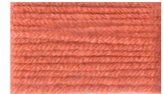
830 After Glow