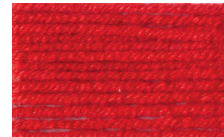
808 Date Night